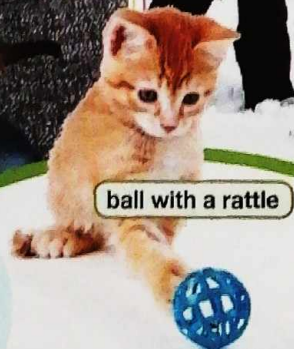
ball with a rattle